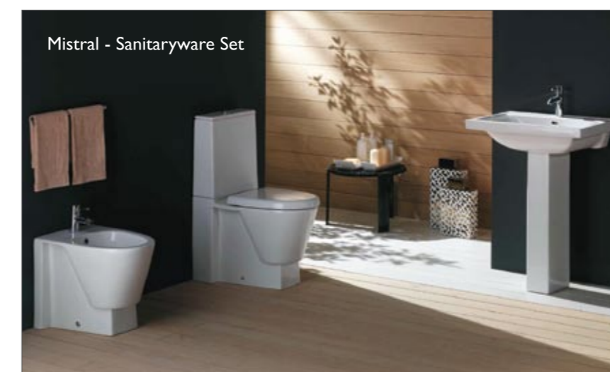
Mistral - Sanitaryware Set

RAK Ceramics employs the latest Italian technology for production, using computerised kilns, Italian and British Design Consultants for the latest designs, highest quality raw materials from Europe; a computerised modelling facility to design fascinating models and an in-house quality control and testing laboratory of the highest standards.