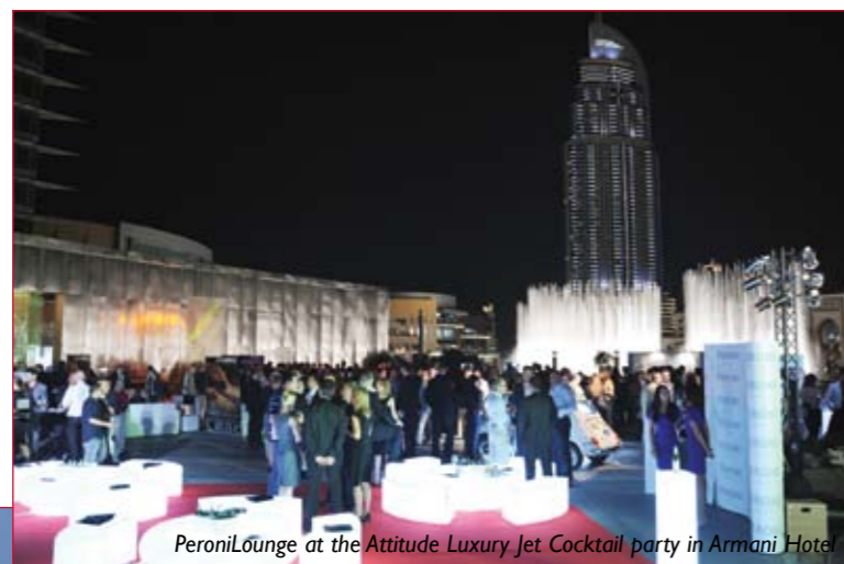
Peroni Lounge at the Attitude Luxury Jet Cocktail party in Armani Hotel

African + Eastern has been bringing the world's most renowned beverage alcohol brands to the Middle East for over 37 years. Established in 1962, by Unilever Arabia as a small trading company, African + Eastern has rapidly evolved to be the largest importer and distributor of world class beverage brands in the Middle East and Arabian Gulf region. The company employs more than 300 professional staff throughout the UAE and Oman who are extremely passionate about delivering outstanding service levels to suppliers and customers.