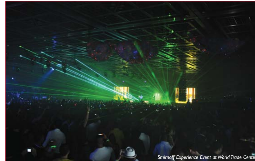
Smirnoff Experience Event at World Trade Center