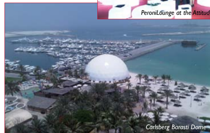
Carlsberg Barasti Dome

The company's original local footsteps are today leaving global footprints. African + Eastern is a company where diverse cultures, brands, skills and tastes from around the world come together to create the perfect blend. A blend that is evolving to keep pace with the developments of this dynamic region, but that in itself serves a simple purpose: to make sure that the company excels at exceeding the expectations and needs of all its customers, brand partners, employees and stakeholders. This purpose and mission has steered the company to the success that it is